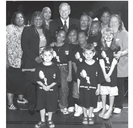
Ohio Gov. Ted Strickland and AFSCME child care providers at Council 8's 2007 convention.

In addition to Ohio, AFSCME represents about 150,000 family child care providers in California, Iowa, Kansas, Michigan, Minnesota, New Jersey, New York, Oregon, Pennsylvania and Wisconsin.